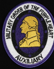
Item 201 Embroidered Patch