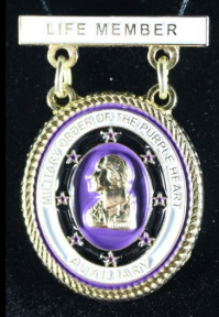
Item 102 Life Member Pin