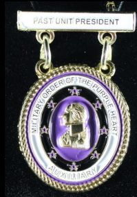
Item 106 Dept Past Pres Pin