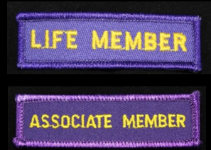
Item 204 and Item 205 Embroidered Patch