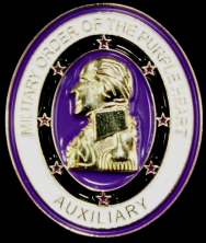
Item 101 MOPHA Logo Pin