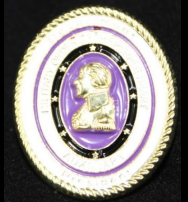
Item 105 Dept President Pin