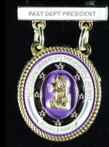
Item 104 Unit Past Pres Pin