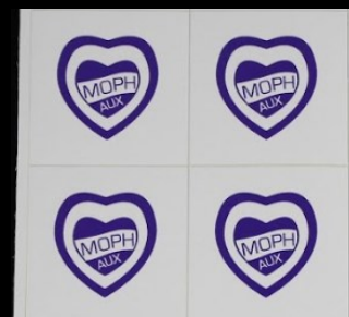
Item 409 Stickers

More items, detailed description and prices available on the SUPPLY ORDER FORM in the members section on the MOPHA website.