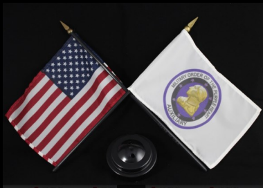
Item 401 Flag Set 3 piece set or MOPHA Flag only