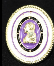
Item 103 Unit President Pin